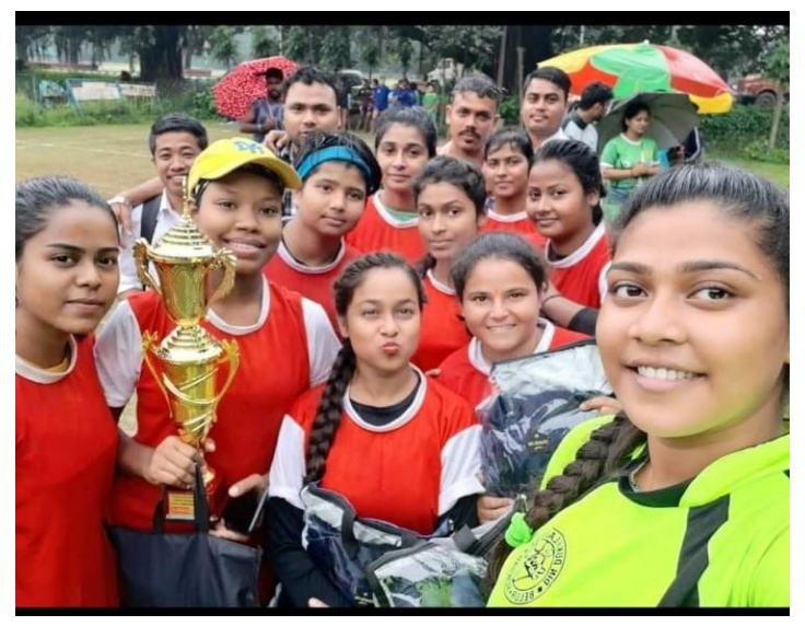
Kabaddi Women Runners team